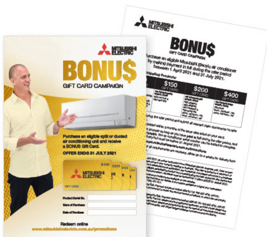
A5 Tear Pads